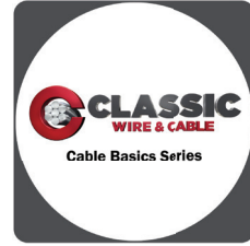
Cable Basics Video Series

Our dedication to going above and beyond is what sets Classic Wire apart. We are committed to providing a high-quality experience to our customers every time.