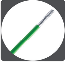
THHN/THWN-2 Aluminum Cable Low Friction 600V