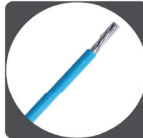
XHHW-2 Aluminum Cable Low Friction 600V