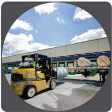
Same-Day Shipping on Stock Orders placed by 11:00AM local time