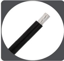
Aluminum USE-2 RHH or RHW-2