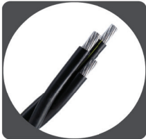
Aluminum URD Cables (Underground)