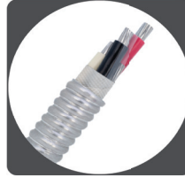
Type MC Aluminum Armored Cable 600V