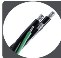
Mobile Home Feeder (MHF)