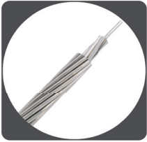
Bare Aluminum Cables